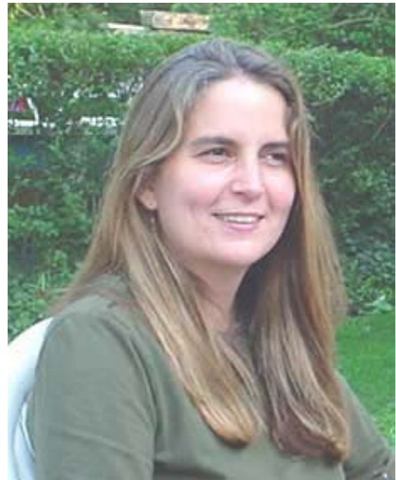
Mystery Photo #10