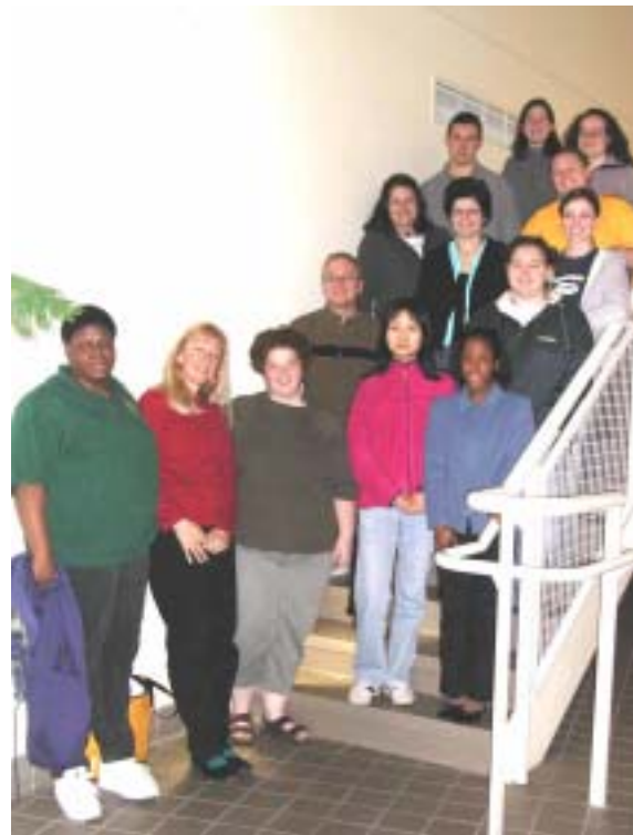
The Bowling Green State University Student Chapter, April 20, 2004.

Congratulations to our new chapter officers!